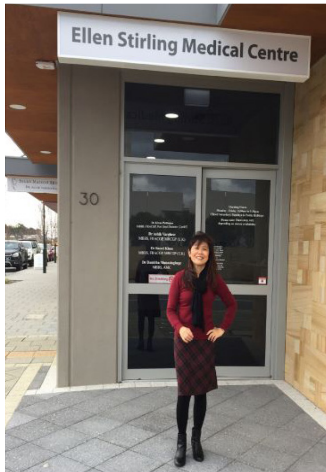
Right: Outside Ellen Stirling Medical Centre - Ellenbrook