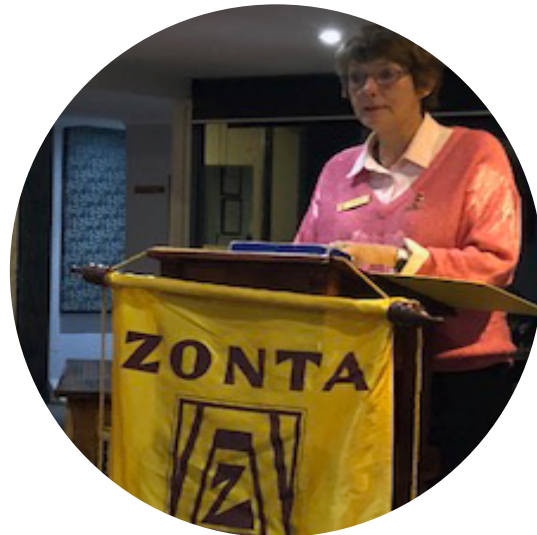
Empowering woman with Zonta