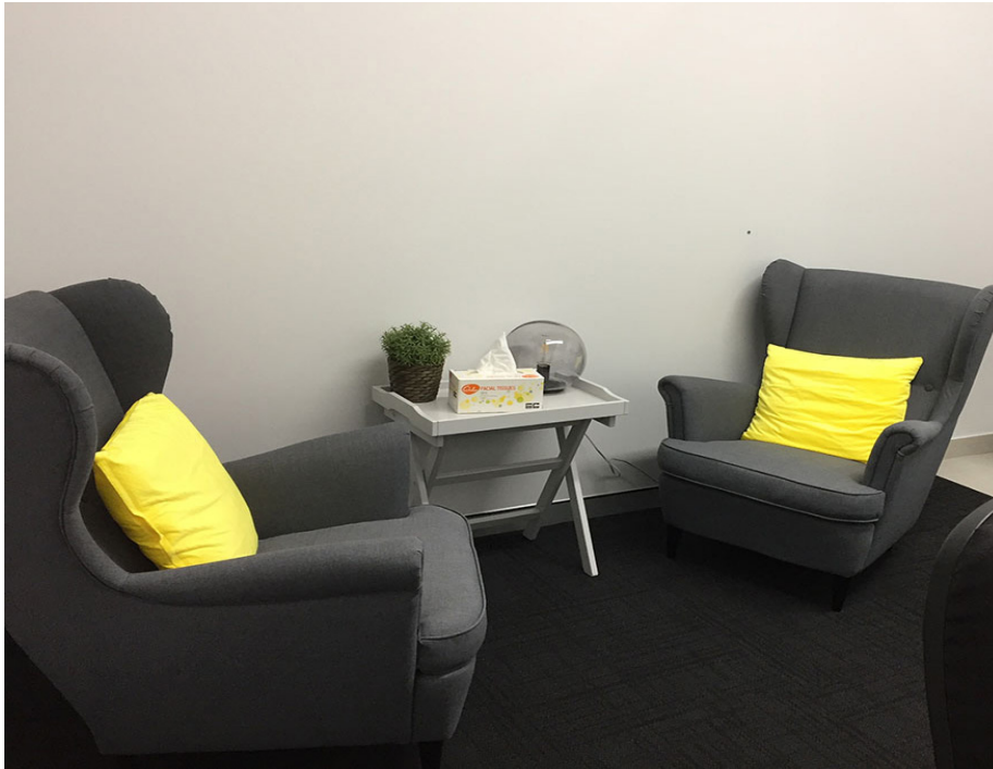
Above: Embrace Counselling Room - Ellenbrook